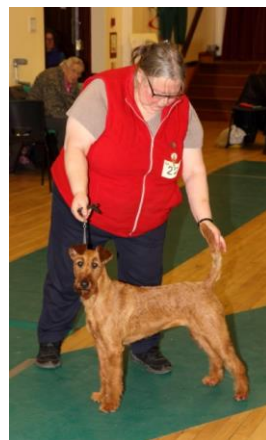
RBB - HOLBAM CELTIC WHISPER