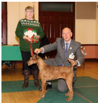
BV – Kerrykeel Mairead of Courtington