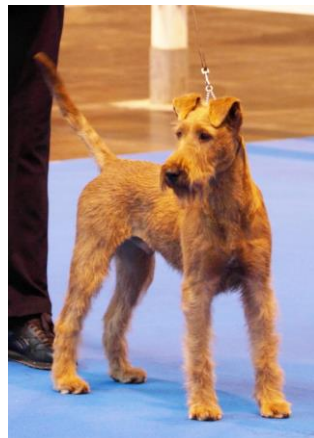
RBD – HOLBAM CELTIC PRINCE